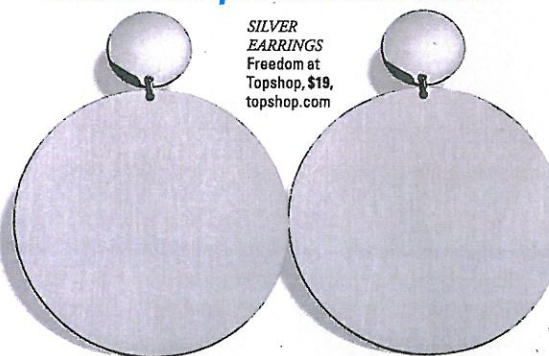
SILVER EARRINGS Freedom at Topshop, $19, topshop.com

Oversize circles give your #OOTD maximum impact with little effort.