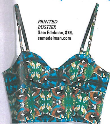
PRINTED BUSTIER Sam Edelman, $79, samedelman.com

Take the crop top up a notch with this super-flattering, feminine shape.