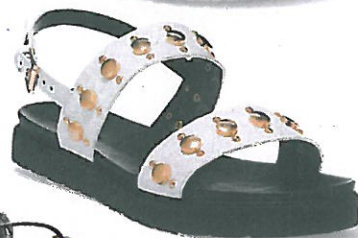
STUDDED SANDALS Forever 21, $30, forever21.com