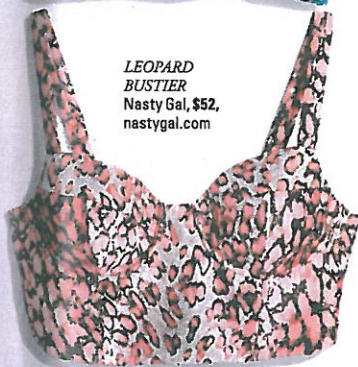
LEOPARD BUSTIER Nasty Gal, $52, nastygal.com