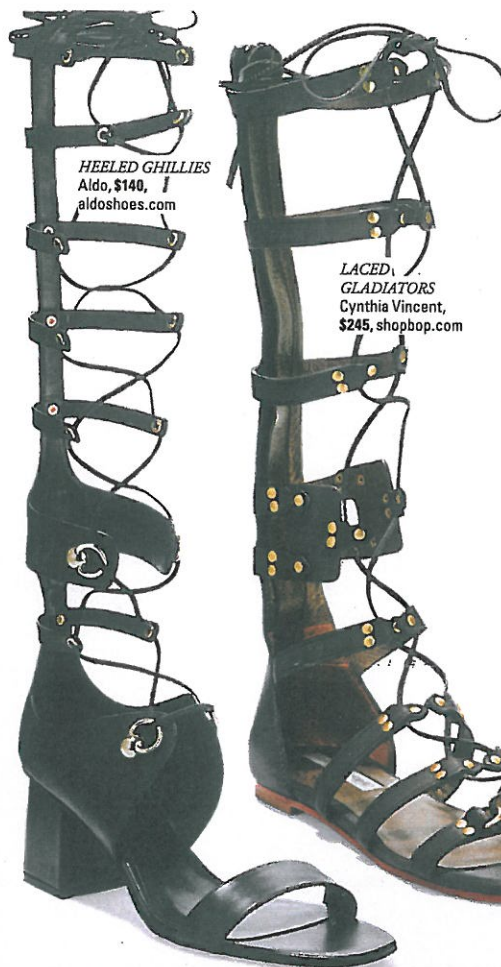
HEELED GHILLIES Aldo, $140, aldoshoes.com