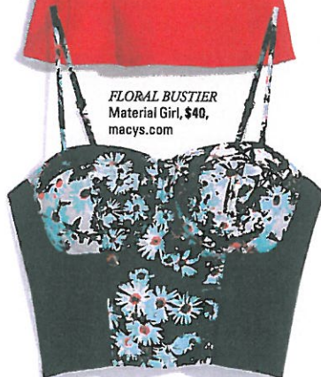
FLORAL BUSTIER Material Girl, $40, macys.com