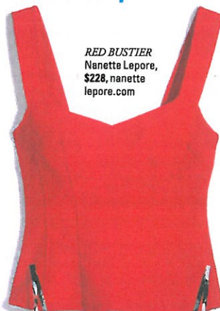
RED BUSTIER Nanette Lepore, $228, nanettelepore.com