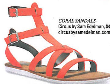
CORAL SANDALS Circus by Sam Edelman, $45, circusbysamedelman.com

Low or knee-high, the warrior look lends a tough touch to sweet dresses.